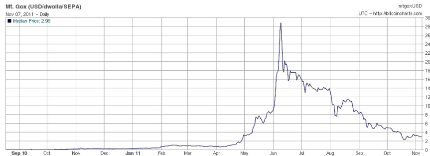
Figure 2. Bitcoin to USD exchange rate on the Mt. Gox exchange through October 22, 2011.

In May 2010, one bitcoin traded at half a cent. It rose steeply until it reached $30 in June 2011 (a 600,000% increase) before crashing back to $2 in October 17 , as illustrated in Figure 2.